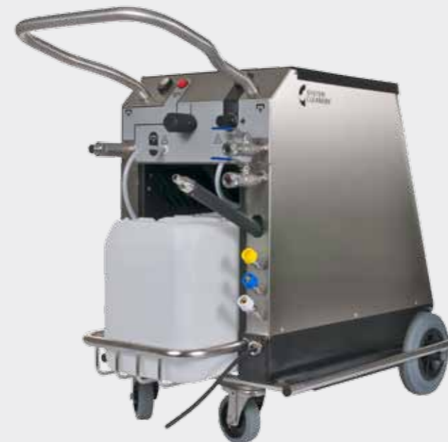
The model illustrated has an extra outlet and a protective frame